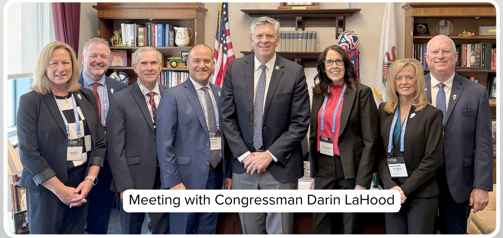
Meeting with Congressman Darin LaHood