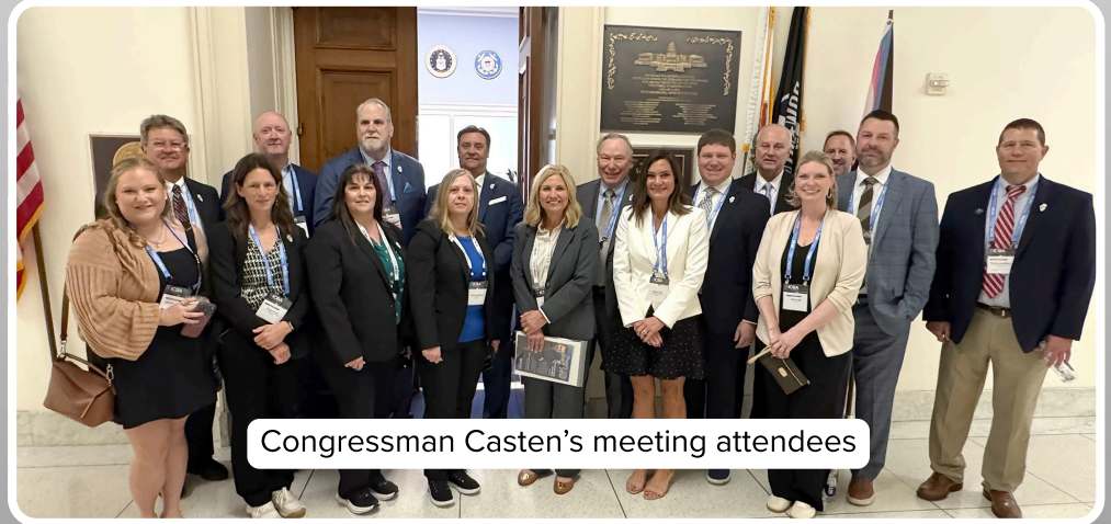
Congressman Casten's meeting attendees