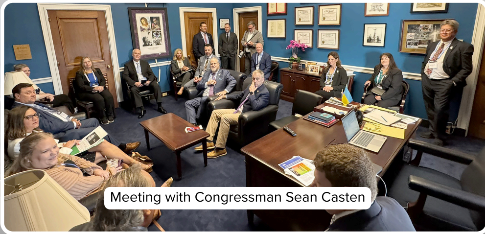
Meeting with Congressman Sean Casten