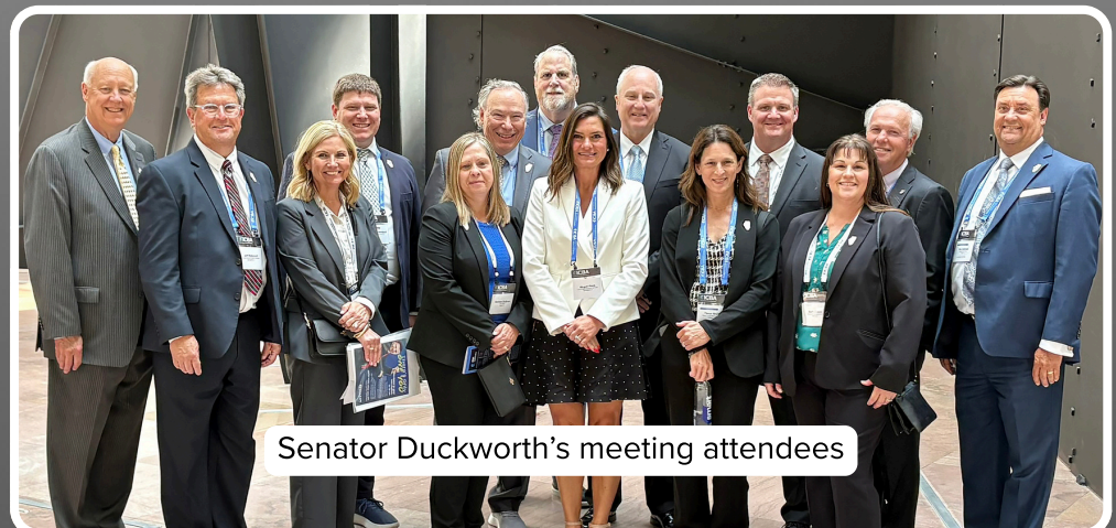
Senator Duckworth's meeting attendees