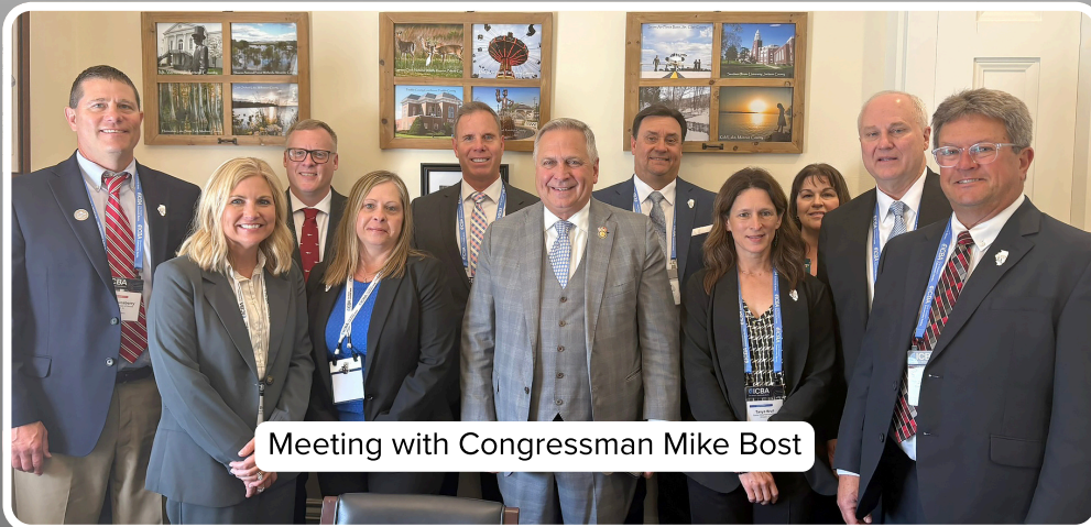
Meeting with Congressman Mike Bost