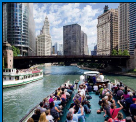
THE BEST OF CHICAGO RIVER CRUISE

In the world of iconic architecture, only a few images are so instantly recognized and need no subtitle - the unmistakable skyline of Chicago is one of them. Each year thousands of architecture lovers make a pilgrimage to this birthplace of the skyscraper. This river tour includes more than 40 Chicago landmarks, including, the Tribune Tower, Wrigley Building and Marina City! When the cruise returns to the dock, guests will be escorted just a short walk from the river to enjoy lunch at Labriola!