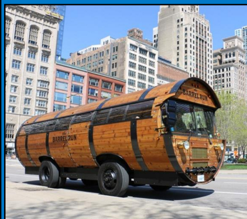
BARREL BUS TOUR