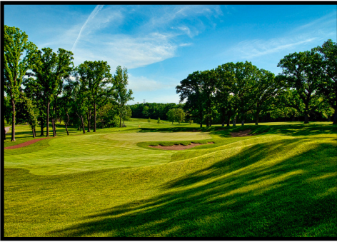
FLOSSMOOR GOLF CLUB

The Golf Outing at CBAI's 47th Annual Convention & Expo on September 23, 2021, will be held at Flossmoor Golf Club in Flossmoor. Founded in 1899, Flossmoor Golf Club was one of the first clubs established in the Midwest and is a classic parkland course that evokes memories of days gone by. Challenging for Bobby Jones, Chick Evans and Frances Ouimet, it still remains a true test of golf today. FGC boasts 14 original hole corridors from 1899 and has had a recent full-scale restoration, providing strategic challenges for golfers of all abilities. Its layout and design have stood the test of time. It's classic, it's challenging and it's a load of fun!